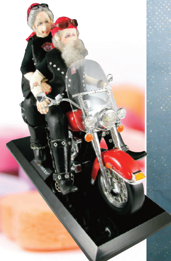
Above: Joy Riders may "drum to a different beat" than most, but that doesn't make their love any less real! The 10-inch cloth-and-leather piece is priced at $595. (Web site: www.joycepatterson.com )